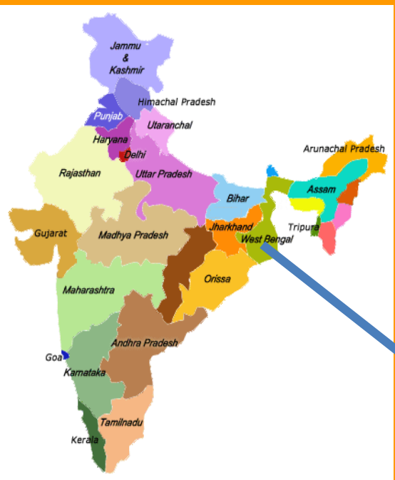
Plate – 1 Location of Cluster – 4